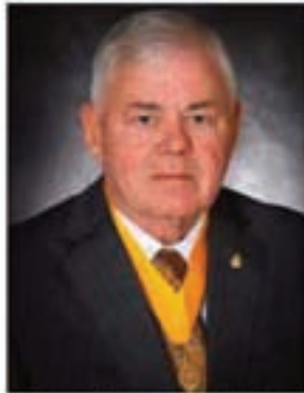
Supreme Governor Wes Crowder

The following are among items brought before the Supreme Council for discussion and/or action during the session held in Lisle, Illinois, October 26-29, 2011. The Supreme Council - Moose International's corporate Board of Directors - assembles each fall, winter and spring, with conference calls held as needed.