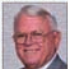
Supreme Councilman Rodney Hammond